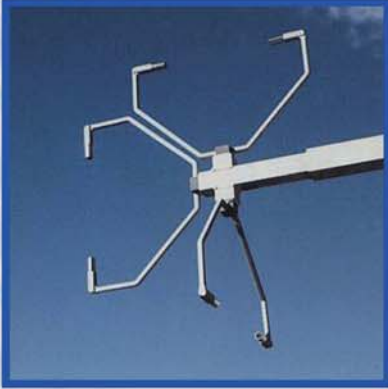
"K" Style Probe

Designed primarily for atmospheric boundary layer studies, but suited to a broad range of wind sensing applications. Array design assures minimum flow distortion errors in measured turbulence statistics.