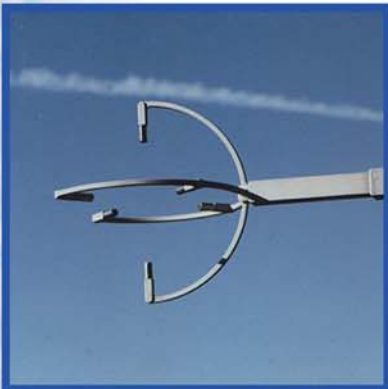
"Vx" Style Probe

A non-orthogonal design for applications that require a high range of velocity.