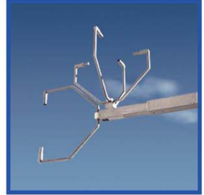
"Sx" Style Probe

Designed primarily for atmospheric boundary layer studies, but suited to a broad range of wind sensing applications. Array design assures minimum flow distortion errors in measured turbulence statistics.