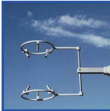
"A" Style Probe

Ideal for environmental monitoring applications where the horizontal wind measurements are required to be in the same plane.